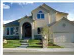
Conserve water here

A. NO! A failing septic system can leak straight into the groundwater. Even pumping may not solve this problem. Have your system inspected today!