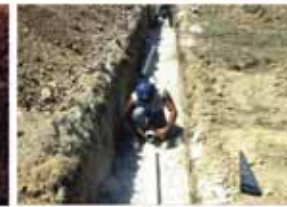
80% of treatment occurs in soil