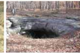
Poorly treated sewage can contaminate groundwater, especially in karst