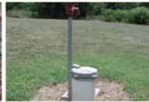
Wells draw up contaminated water if sewage flows into groundwater