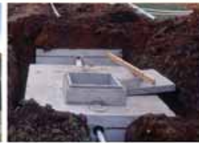
20% of treatment in tank through settling of solids